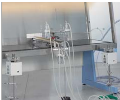
Microbiological testing of personal protection.

Only microbiological safety cabinets (MSC) that eliminate the contamination in these provocation tests quickly and safely correspond to the state of the art and meet our high quality standards. You can rely on microbiologically tested safety cabinets from BERNER .