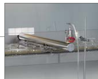
Microbiological testing of product protection.