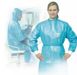
Personal Protective equipment