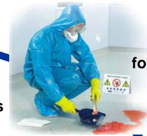
SpillKits for emergencies