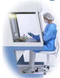
Cytostatic safety cabinets