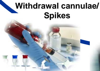
Withdrawal cannulae/ Spikes