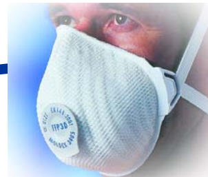
FFP3 respiratory protection masks