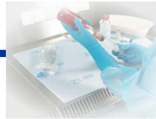
Protective safety gloves