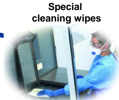
Special cleaning wipes