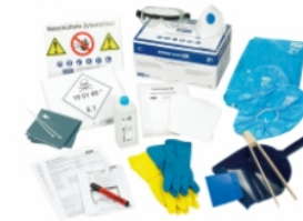
Single use items