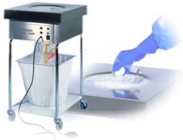
Disposal units for cytostatics