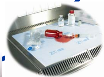
Cytostatic prep mats